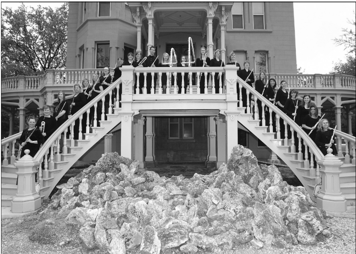
Flutopia! , a 25-member flute ensemble, will present "Christmas Around the World" on Dec 6 as part of the PAC's Mini-Christmas Tree Festival.

Saturday, Dec. 7, Santa's helpers will be available to help children preschool age and older in making Christmas crafts to take home. This is a free event, and children are invited to attend from 10 a.m. to 1 p.m. The gallery will remain open until 4 p.m. The mini-tree festival will continue through 3 p.m. Dec 8, when the drawing will take place for the winners of each raffle item. You do not need to be present to win.