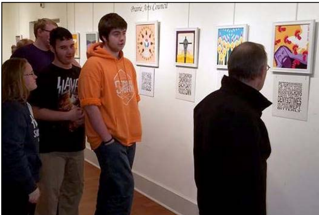
We had 194 visitors to our October Gallery Exhibit! Special thanks to the volunteers at Second Story for bringing a caravan of teenagers over for a private viewing.