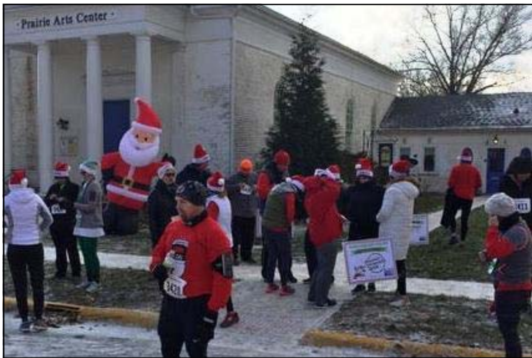
Runners gathered in front of the PAC on December 9th for the Second Annual Bureau County United Way "Run for A Claus 5K"