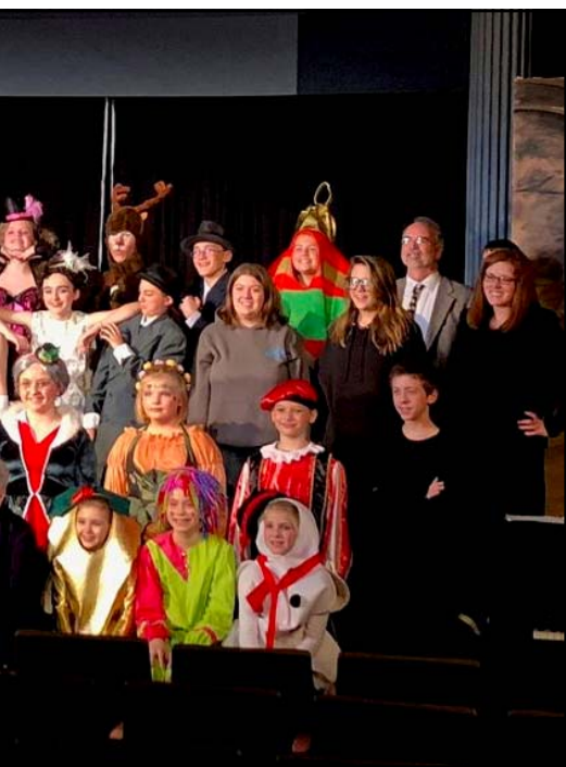
The One, the Only, Christmas Fairy the PAC's young actors by local son, who also directed. Great Job!