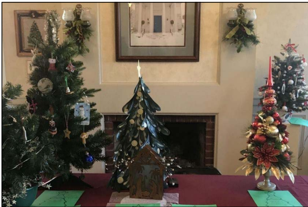
Our annual Christmas Mini-Tree Festival auctioned off 34 trees, wreaths and table arrangements that were created and donated by members of our community. Thank You SO MUCH to All!!!